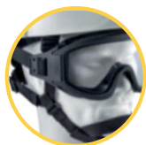
Double-lens goggles with FTR elastic band.