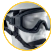
Double-lens goggles with quick release.