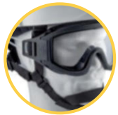
Double-lens goggles with silicone cord.